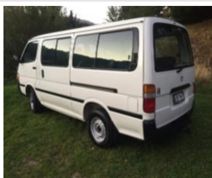
Photo of similar vehicle

Valid as at 04 mars 2019 17:30 PM . Reference: c7721dda